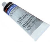
67-4T 04637336 Grease for high-speed angle heads