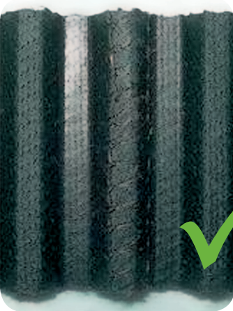
Timing belt in HSN construction.

Examples of different stitched/welded joints.