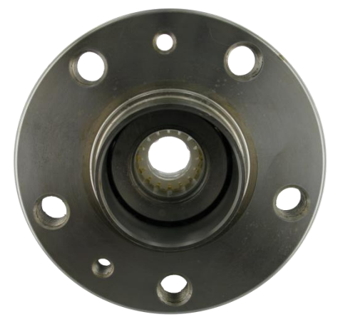
Bearing with plastic joining sleeve

SKF use safe packaging solutions to protect the wheel bearing from damage during transport or mounting. VKBA 1435 is delivered with a plastic joining sleeve, to keep the inner rings together, until the bearing is mounted on the car.